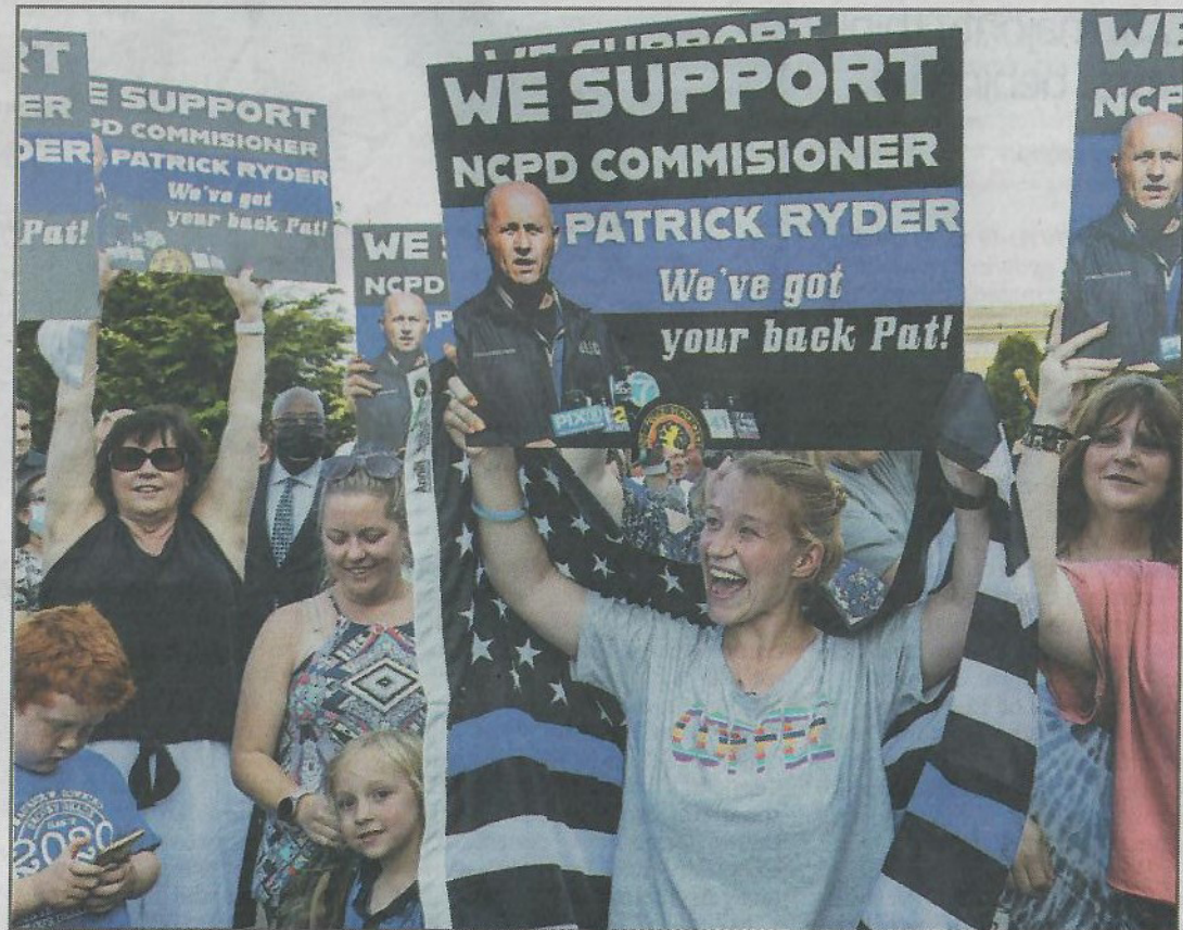
Hundreds rally to show support for Nassau Police Commissioner Patrick Ryder Monday in Mineola.

Black and Hispanic candidates were eliminated from con-