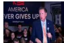
Political Pulse: Aug. 8, 2016 ▶ VIDEO