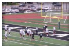
Elmont 35, Mepham 33 ▶ VIDEO