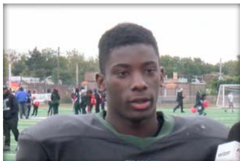
Player of the game: Elmont vs. Mepham ▶ VIDEO