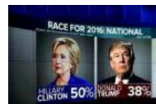
Political Pulse: Oct. 24, 2016 ▶ VIDEO