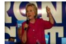
Political Pulse: Aug. 10, 2016 ▶ VIDEO