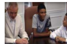
Our Community: Stop The Bounce ▶ VIDEO