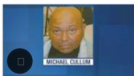
Officials: Nassau Jail inmate death is 6th this year