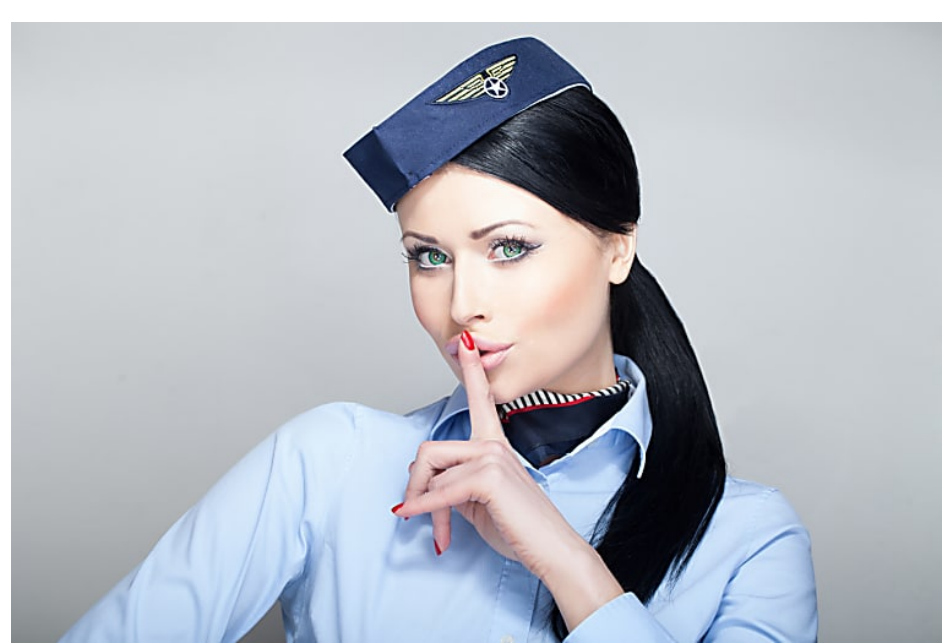
Flight Prices You're Not Allowed to See!