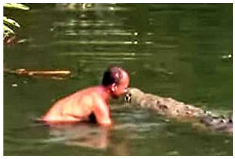
Farmer Rescues Injured Crocodile: 20 Years Later, This Happened