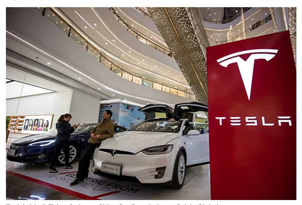
Tesla's Musk Takes Swipe at China Car Restrictions - Caixin Global Caixinglobal.com