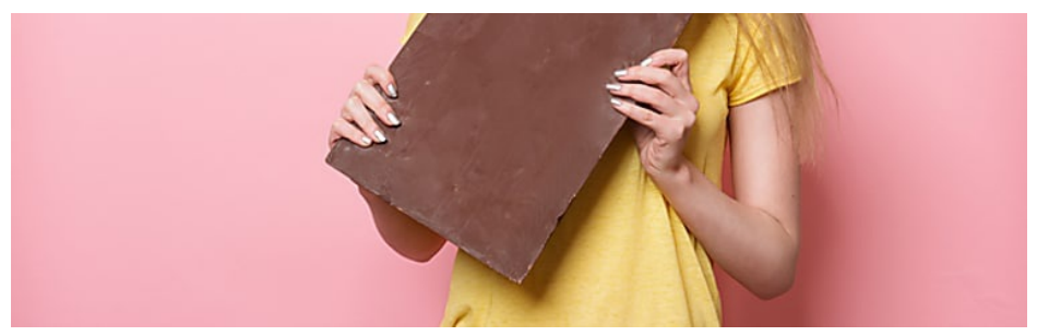
Delicious Chocolate Of High Quality And Intensity From Brazil