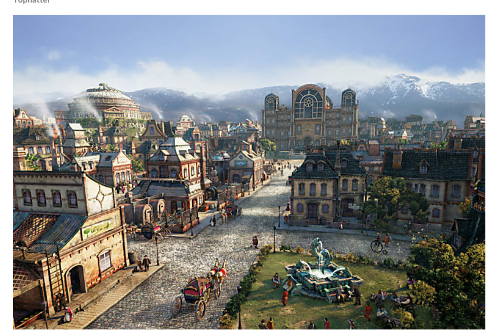
The Most Addictive Game of the Year