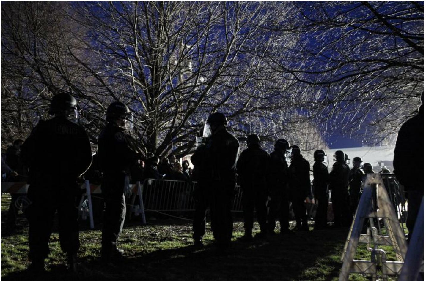
Police in riot gear stand outside of a rally for Donald Trump in Bethpage, Long Island.